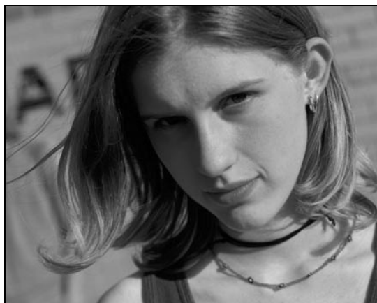
Homelessness can't be determined by appearance. For information on recognizing the warning signs of homelessness among students, visit www.serve.org/nche/nche_web/warning.php .